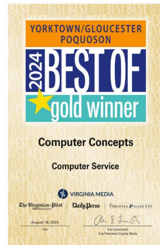
Yorktown's Daily Press

A Special Thank You To All Who Supported Us In the "Virginia's Best of" Contests