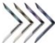
MacBook Air M2

Simply "click" on the catalog type you are interested in for additional information and the desired information page will open.