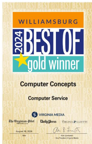
Williamsburg's Virginia Gazette