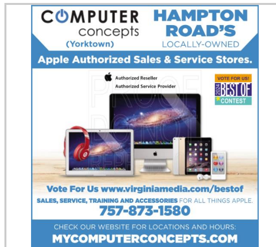
Computer Concepts, Yorktown, competed in the Daily Press Campaign

Voting is Complete! Results Will be Announced Later this Year THANKS to All that Took the Time to Vote for Us!