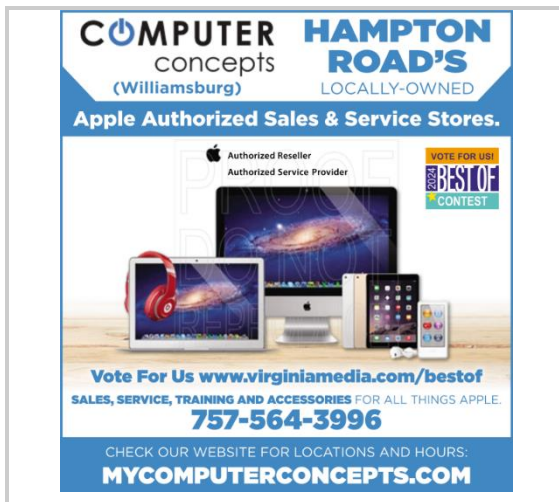
Computer Concepts Williamsburg competed in Virginia Gazette's Campaign